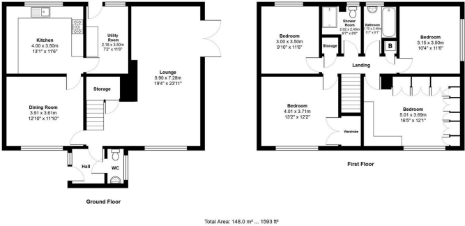
Total Area: 148.0 m 2 ... 1593 ft 2

Obscure double glazed window to rear aspect. Tiled double shower cubicle. Heated towel rail. Low level WC. Fully tiled.